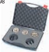
DuoExpert system (3 collets in a case, 54 – 78 mm)