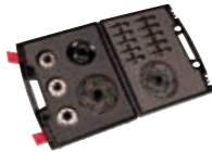
Kit demo box for passenger car