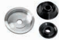
Set of light truck cones 88 – 174 mm