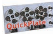
Set of QuickPlates (4-, 5-, 6-holes-plates)